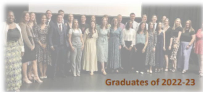
Graduates of 2022-23

Train to teach here, or at another school local to you! Gain qualified teacher status (QTS), and an optional post-graduate certificate in education (PGCE) through the Essex Schools ITT initial teacher-training programme.