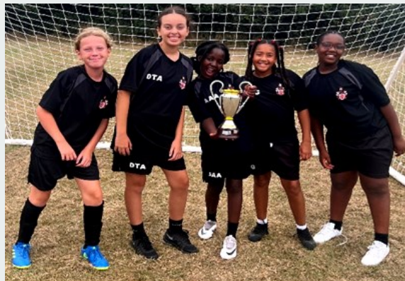
WINNING GIRLS TEAM – YEAR 7 SALISBURY