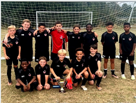
WINNING BOYS TEAM - YEAR 7 SALISBURY

Congratulations to the winning teams and a huge well done to all the boys and girls that took part.