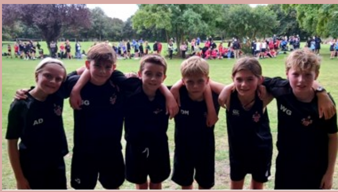
YEAR 7 BOYS CROSS COUNTRY TEAM - LVAC