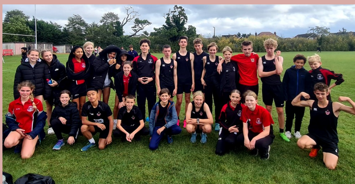
Davenant participants in the English Schools Cross Country Year 7 through to Year 12