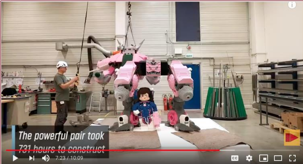
Timelapse: 10 Epic LEGO Models Built Before Your Eyes!