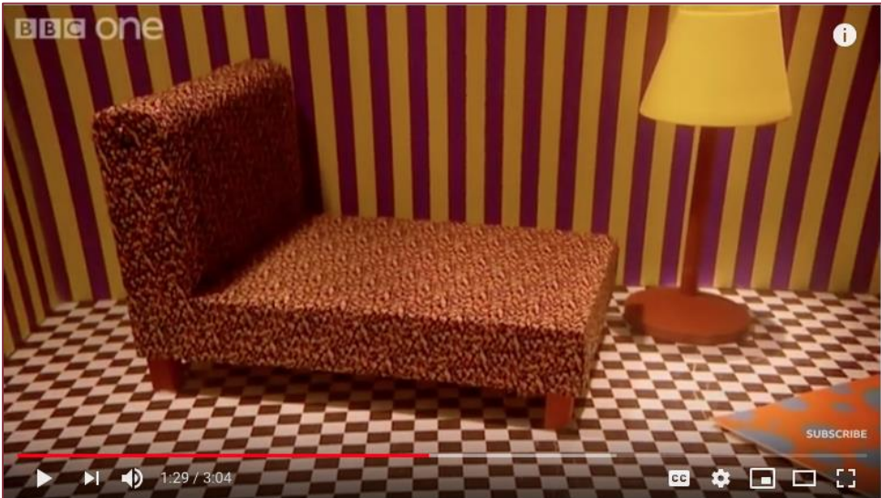
#bbc #MiraclesOfNature Can Cuttlefish camouflage in a living room? | Richard Hammond's Miracles of Nature - BBC