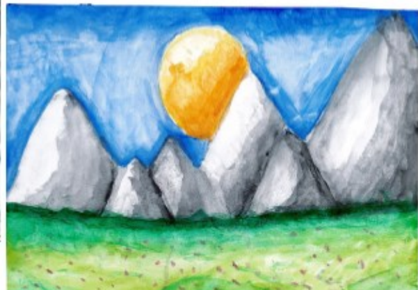
GIRLS MURAL Winners