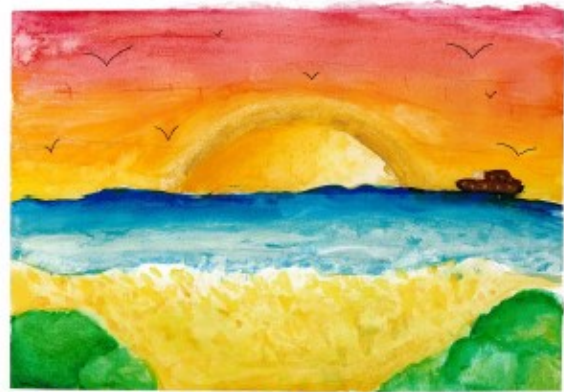
First - A Gardner - Gillingham