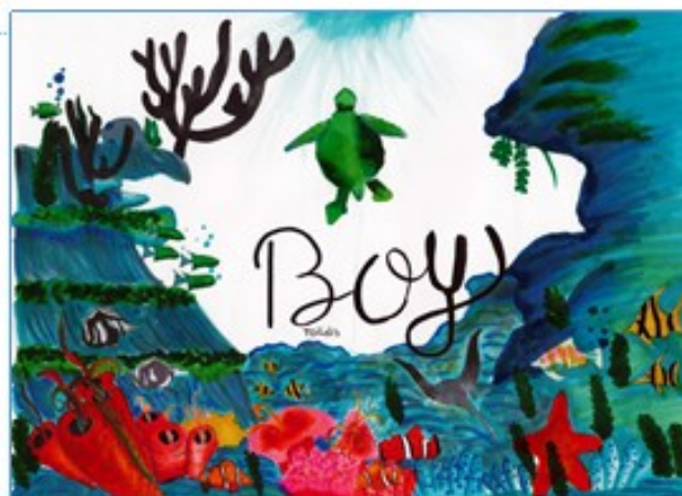
First: L Rakowski - Salisbury