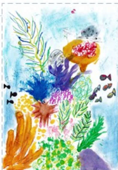
Second: E Plant - Salisbury