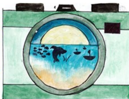
BOYS MURAL Winners