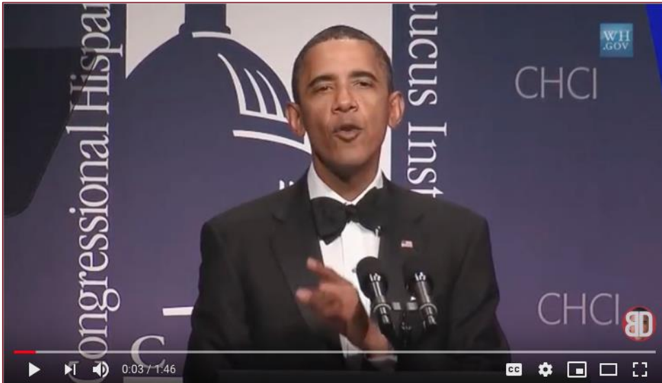
Barack Obama Singing Call Me Maybe by Carly Rae Jepsen